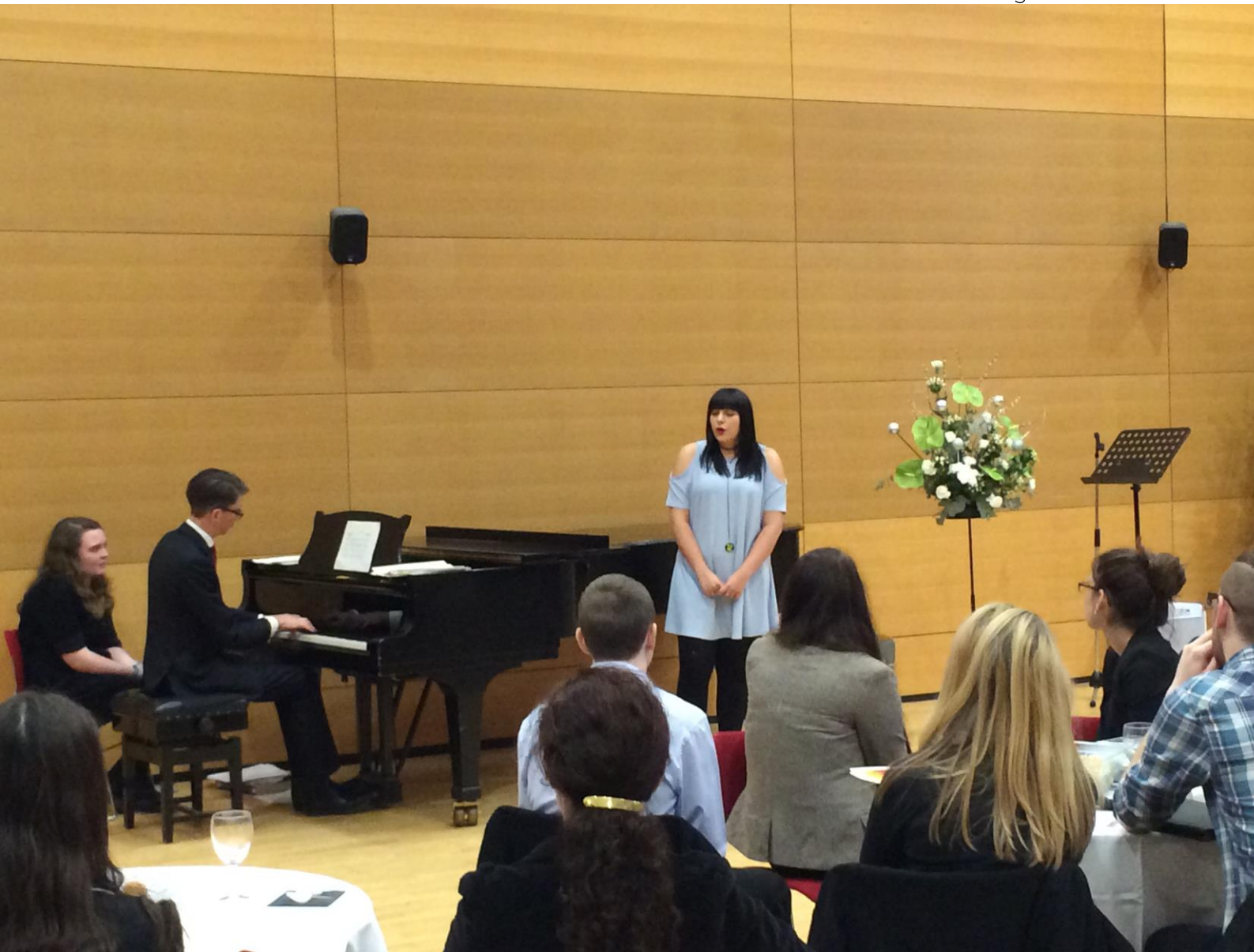
The musical gala dinner