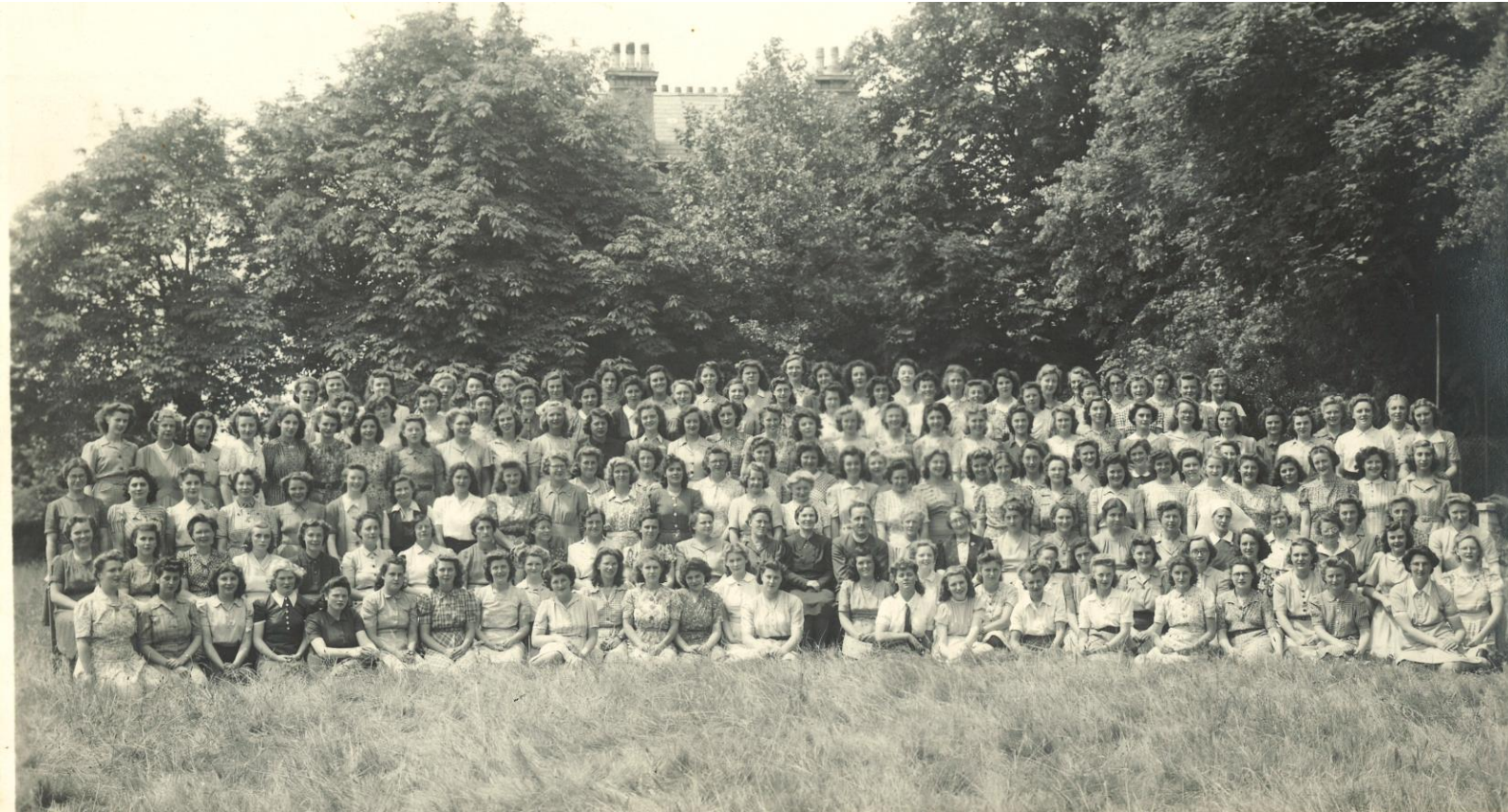
Southlands Students, 1943