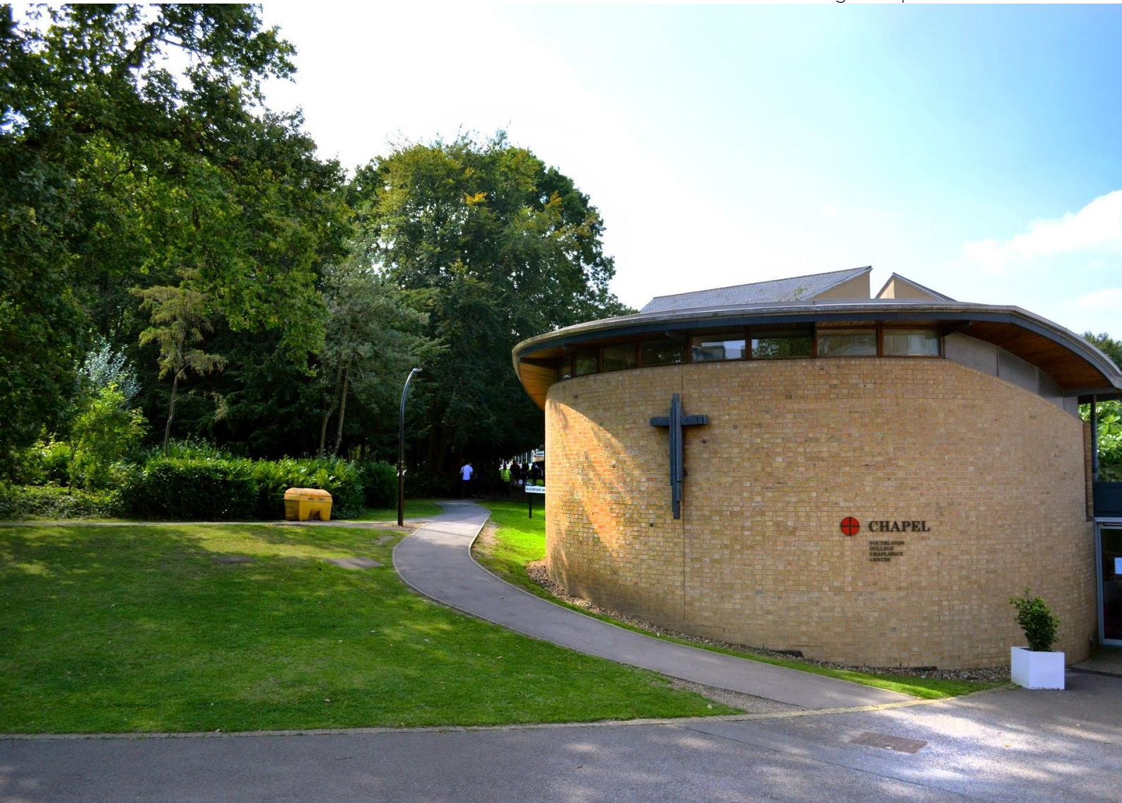
Southlands College Chapel